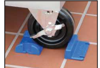
Adhesive Foam Tape