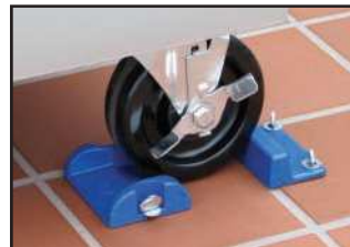
Thumb Screw Hardware Pack

Each Safety-Set system includes both the adhesive foam tape and the thumb screw hardware pack for your convenience.